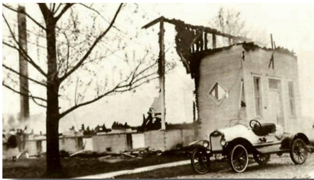
Bethel Fire – May 12, 1923