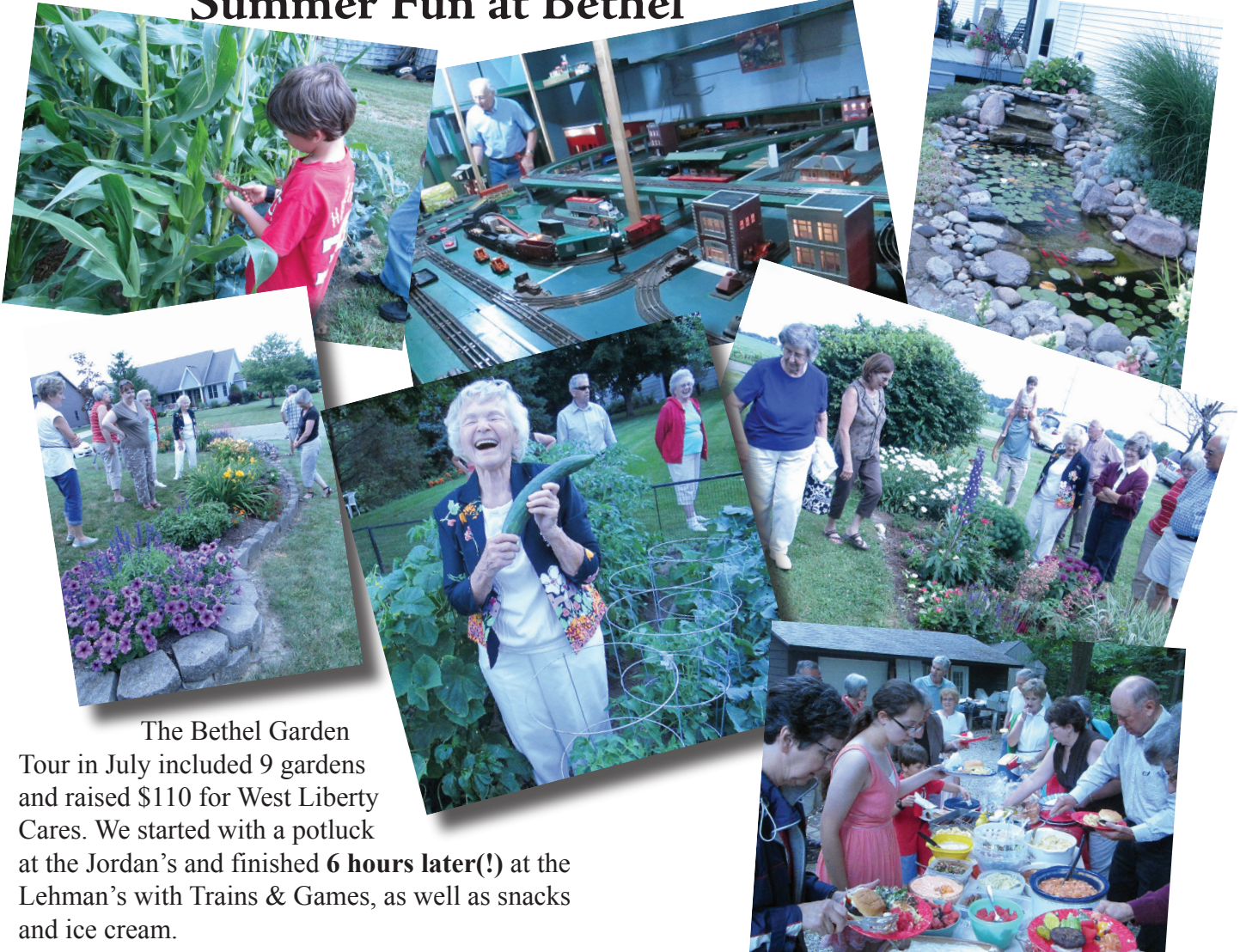
The Bethel Garden Tour in July included 9 gardens and raised $110 for West Liberty Cares. We started with a potluck at the Jordan's and finished 6 hours later(!) at the Lehman's with Trains & Games, as well as snacks and ice cream.