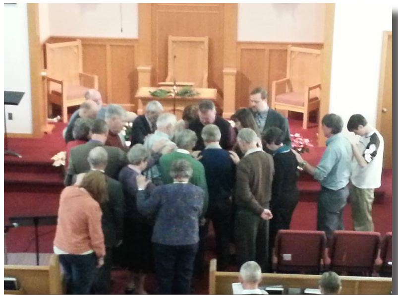
Commissioning of the Elder Leadership Team

We ask for your prayers for our team's discernment and decisions, for yourselves as servants in the Lord's work at Bethel, and for our congregation as we move ahead in hope and anticipation of what Christ has in store for us!